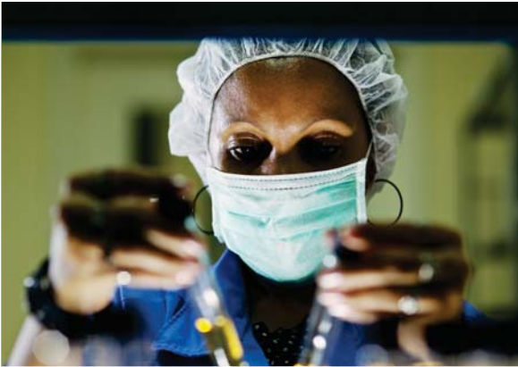
Biotech Lab Technician Training