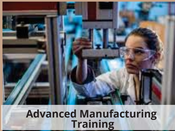
Advanced Manufacturing Training